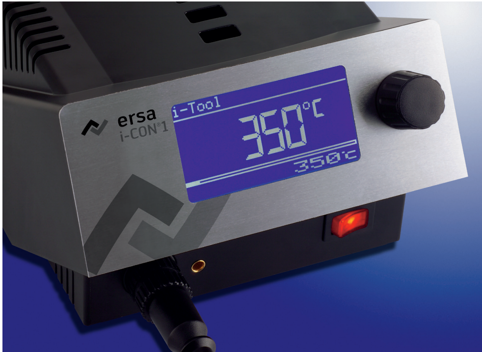
i-CON 1 with i-TOOL