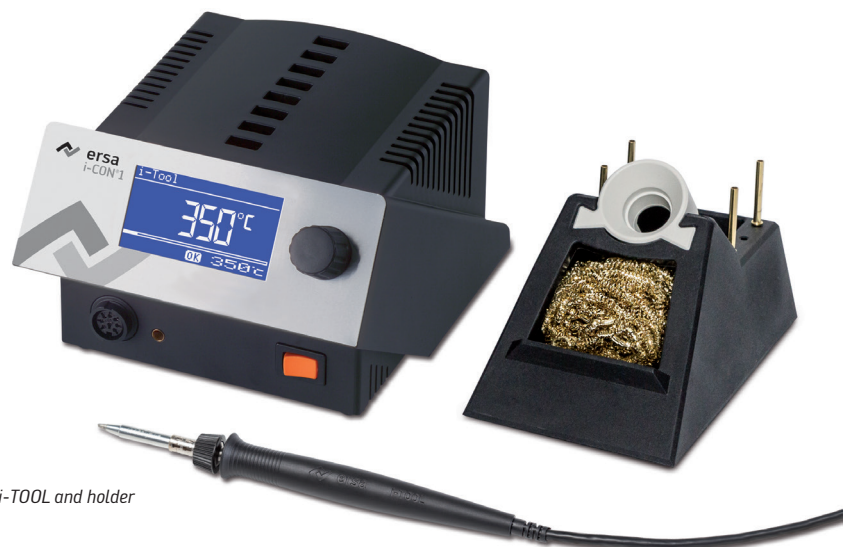
i-CON 1 with i-TOOL and holder